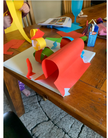
Ally — I can create a 3D sculpture out of paper

Compound Sentences 18/8/21 ● The crocodile is a reptile and ● their body is covered in scales. Crocodiles are slow on land but they are fast in the water. Their lungs are large so they can hold their breath for 6 hours.